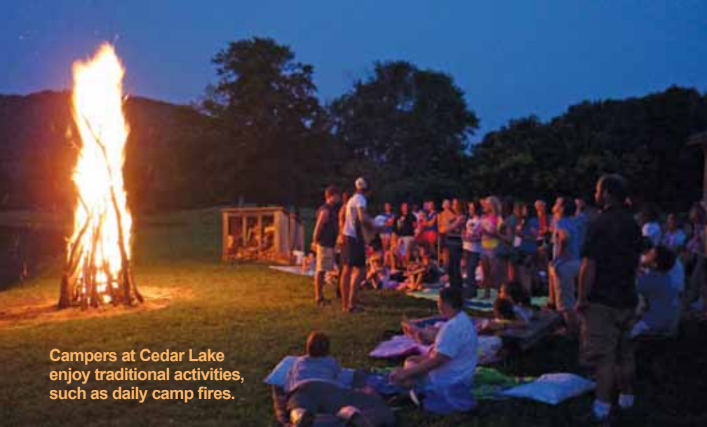
Campers at Cedar Lake enjoy traditional activities, such as daily camp fires.