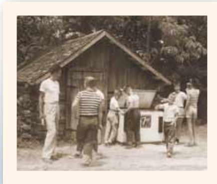
Camp life, circa 1950s

In the late 1920s, local judges and doctors encouraged them to establish a home for needy children. They bought a farm adjoining their property and opened an orphanage in 1931.